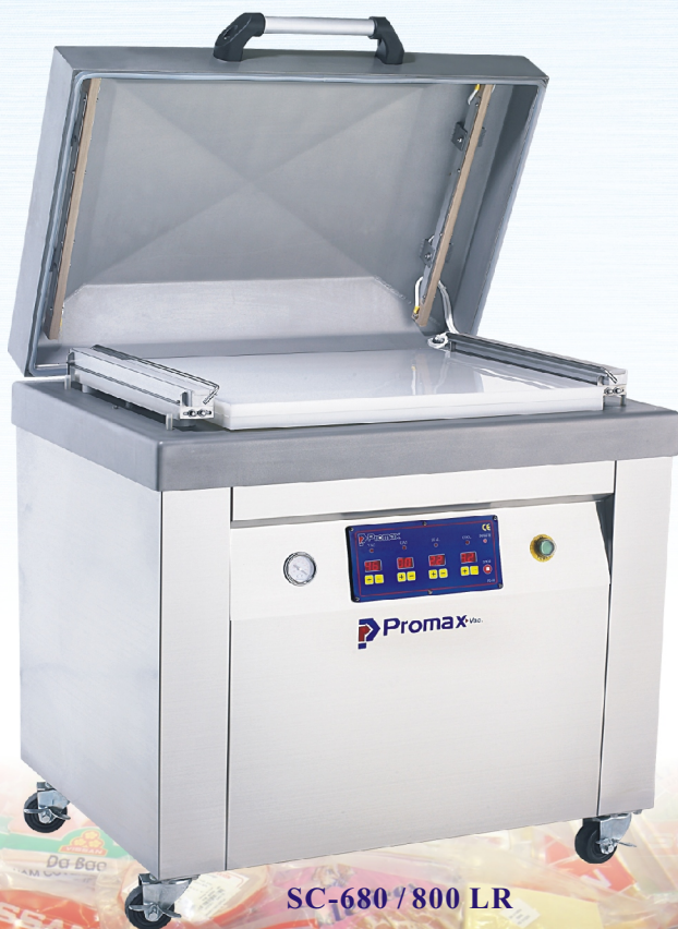
SC-680 / 800 LR